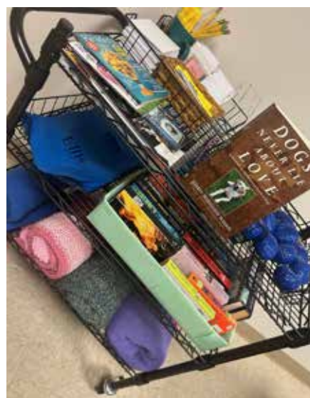
Patient Comfort Care cart at Ellis Medicine