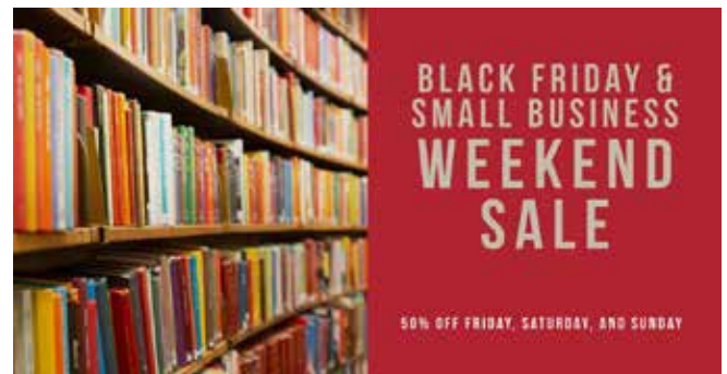
Sale ad promoted on social media