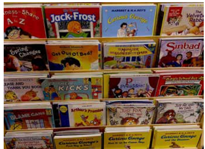
Children's books promoted on social media