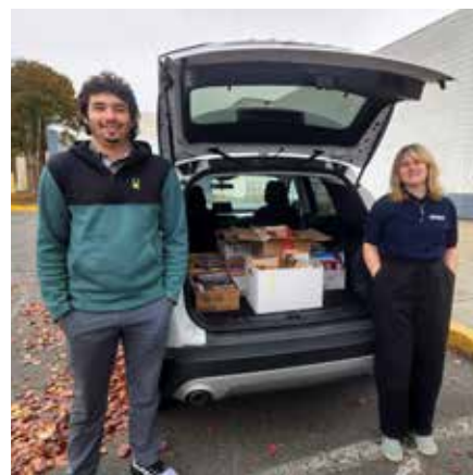
Donating books to Bridges of Schenectady to build a library at the facility