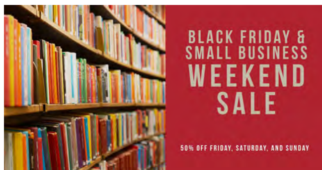
Sale ad promoted on social media