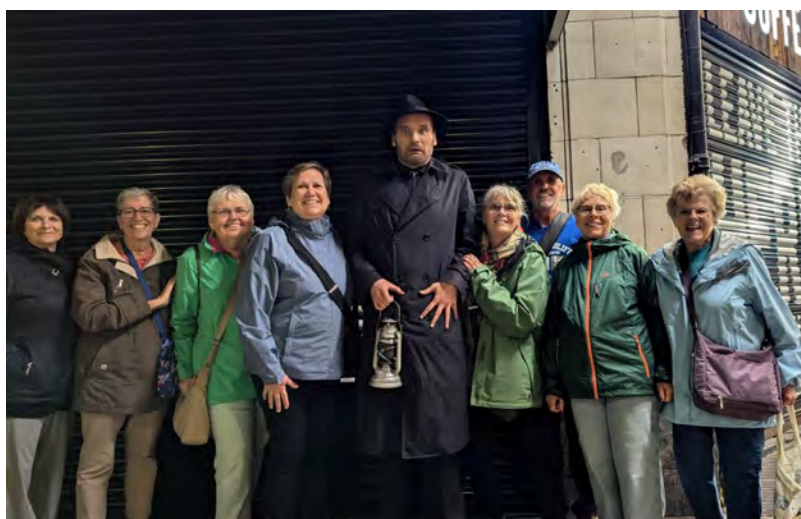
Friends trip to WWII sites in England and France, October 2024