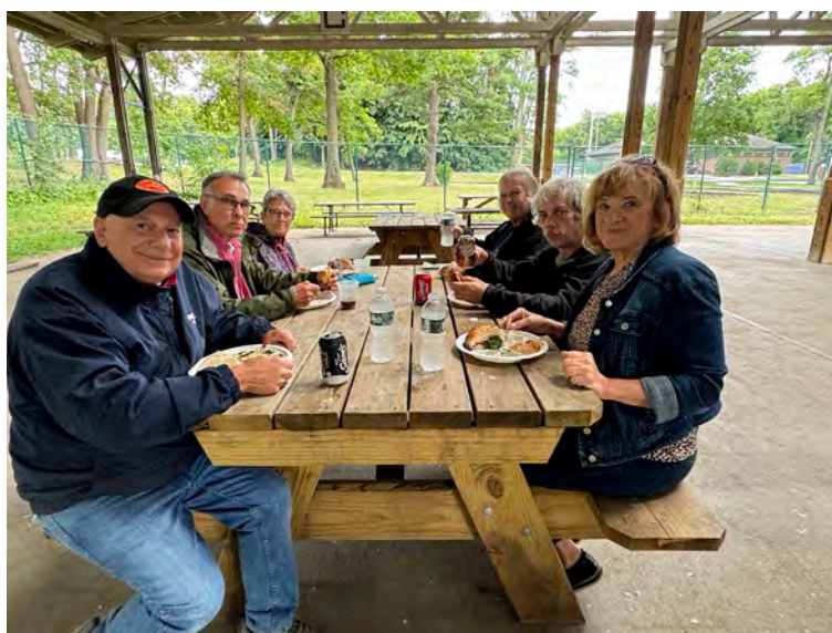
Spring Picnic at Central Park