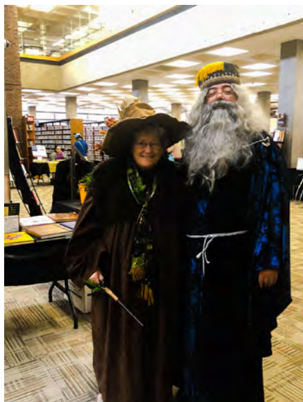
Harry Potter Day at Central Library