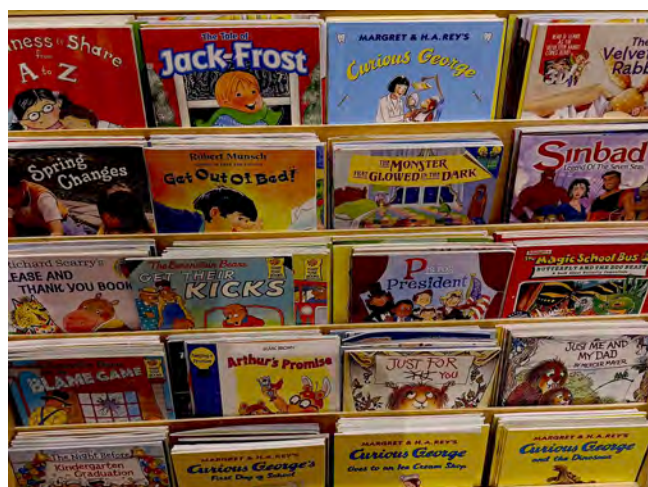
Children's books promoted on social media